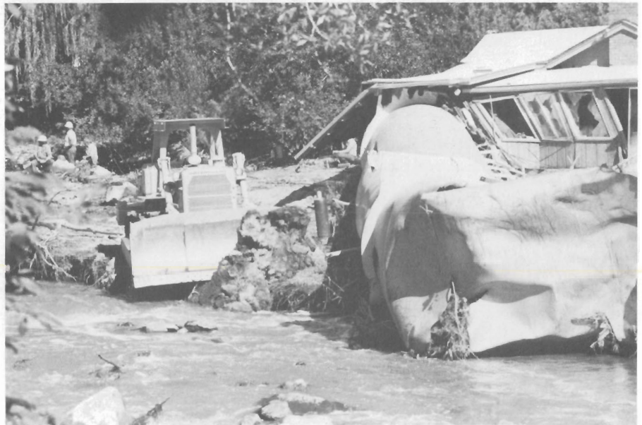
A siphon tube, nine feet in diameter, caught the full force of the huge wall of water and collapsed, slamming into this house. The scene is near the steep-walled area of the canyon known as the Narrows, a few miles west of Loveland.

Bulldozers are everywhere in the canyon now, clearing away debris and restoring the roadbeds. It may take years, but the once-beautiful Big Thompson Canyon will be beautiful again. □